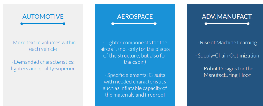
Figure 3 – Main trends for automotive, aerospace and advanced manufacturing sectors

The market trends for the sectors aerospace, automotive, textile and advanced manufacturing share some important aspects such as perspectives of a future increase in production due to the reshoring of manufacturing capacity, as well as a highly exigent demand for the quality and environmental impact of the fabrication. This would have a direct impact on the employment of some value-added material on these industries such as technical and sustainable textiles. The main trends for those sectors in terms of technical and sustainable textiles are: